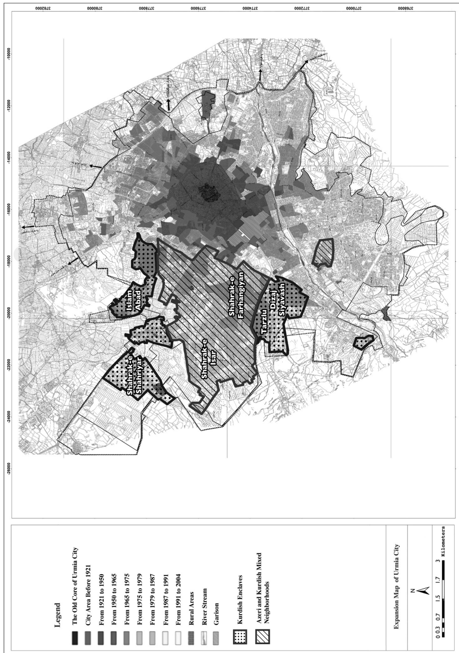
Map 3. The expansion map of Urmia city from 1921 to 2004.