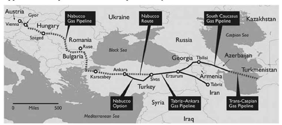
Appendix 3: Map of the Nabucco Pipeline Project