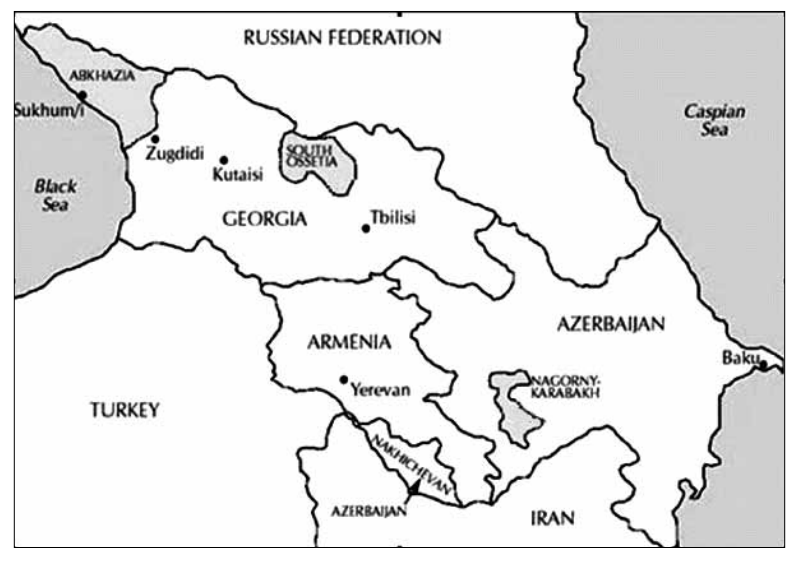
Appendix 1: Map of the South Caucasus states with the separatist regions